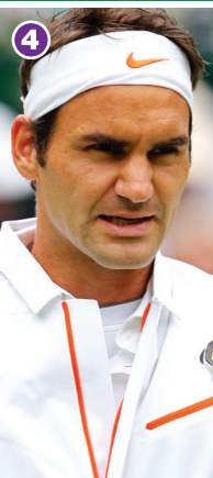
4 Roger Federer (SUI) 32

Arguably final chance for grass court master to surpass Pete Sampras and win 8th Wimbledon title – failed to make final in last 7 Slams, since securing title on Centre Court in 2012