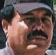
Ismael “El Mayo” Zambada Key Guzman ally in Sinaloa cartel