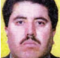
Vicente Carrillo Fuentes “El General” Juarez cartel boss