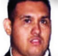
“Omar” Trevino Morales Current leader of Los Zetas cartel