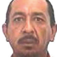
Servando Gomez “La Tuta” Head of Knights Templar cartel