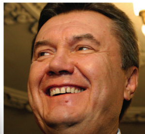
Viktor Yanukovich , 63. President of Ukraine since 2010. Not in rich list