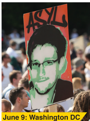
June 9: Washington DC

JAN 9 London Underground, the first railway of its kind in the world, celebrates its 150th anniversary