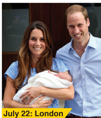
July 22: London

14 Xi Jinping formally becomes President of China, completing the transition of power in the country