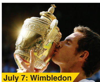
July 7: Wimbledon