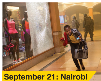
September 21: Nairobi