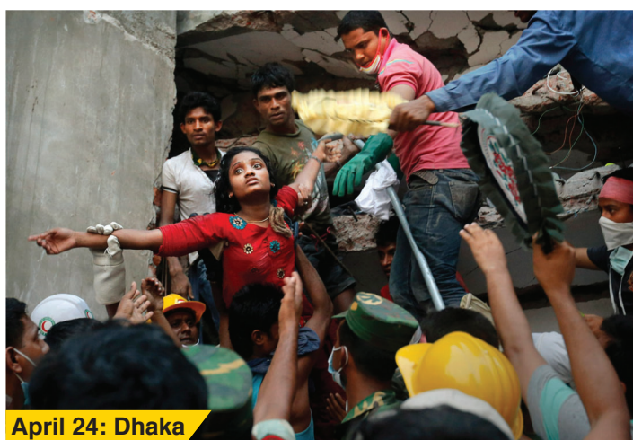
April 24: Dhaka