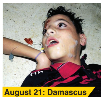
August 21: Damascus