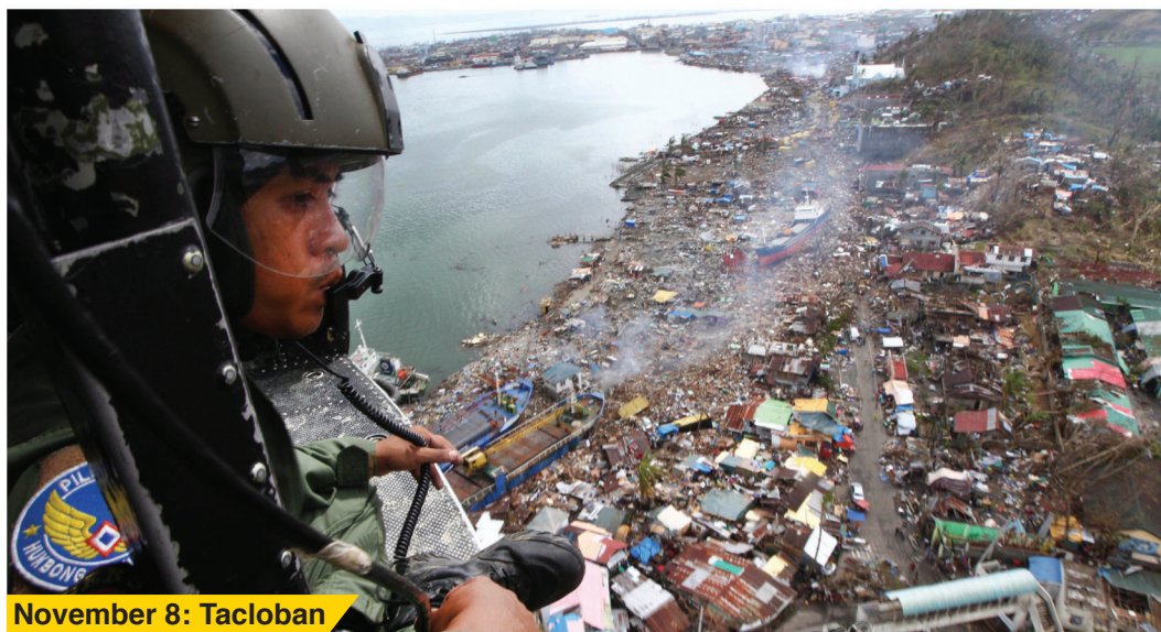
November 8: Tacloban

JUN 9 Ex-CIA contractor Edward Snowden admits revealing details of top-secret U.S. and UK spy programmes to the press