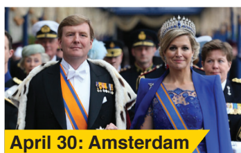
April 30: Amsterdam