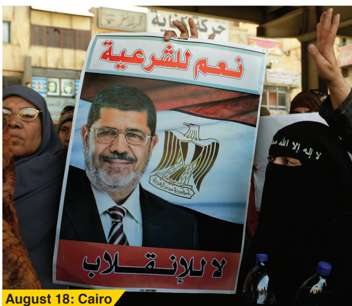
August 18: Cairo

31 Anti-government protests spread to dozens of cities throughout Turkey, sparked by a crackdown on demonstrators in Istanbul