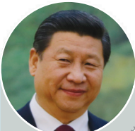
President Xi Jinping

When China declared its new air defence zone on November 23, United States, Japan and South Korea immediately rejected it