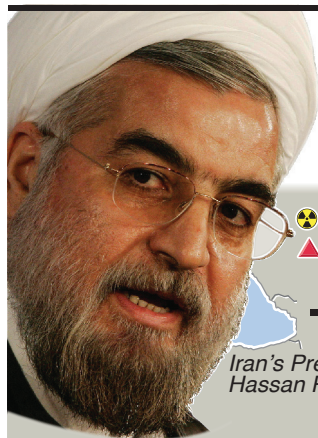
Iran's President Hassan Rohani

Iran will halt its medium-enriched uranium (MEU) programme, stop expanding nuclear sites and agree to daily visits by the UN's International Atomic Energy Agency (IAEA). In return, Iran will receive $7 billion in relief