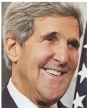
John Kerry , U.S. Secretary of State

Iran and the six world powers are set to reach a preliminary agreement under which the Islamic state would curb some of its nuclear activities in exchange for limited relief from sanctions