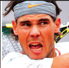
Rafael Nadal (ESP) Rank: 2

Looking to secure 7th major title. Semi-finals or better at Flushing Meadows each year since 2007 – lost thrilling five-set final to Murray last year