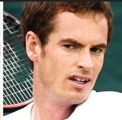
Andy Murray (GBR) Rank: 3

Sealed victory in Cincinnati to claim 9th title of 2013. Shock first round defeat at Wimbledon is only blip in stellar season