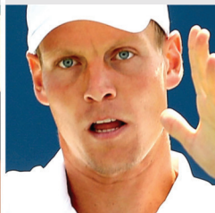
Tomas Berdych (CZE) Rank: 5

Semi-finalist in three of last seven Grand Slams – made first major final at Roland Garros, losing to Nadal