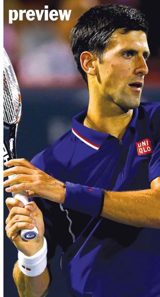
Novak Djokovic (SRB) ATP Rank: 1

Looking to secure 7th major title. Semi-finals or better at Flushing Meadows each year since 2007 – lost thrilling five-set final to Murray last year