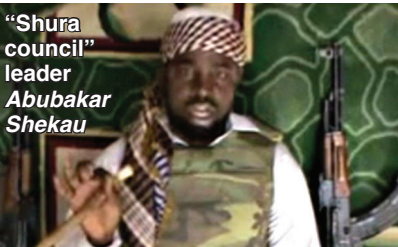
"Shura council" leader Abubakar Shekau

1980: Economic crisis drives wave of Islamic fervour in north