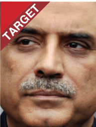
Pakistan People's Party (PPP) Leader: President Asif Ali Zardari PPP candidate

More than 100 people have been killed in attacks in the run up to the nation's general election, with three secular parties especially singled out. Over 4,600 candidates are running for the 342-seat National Assembly