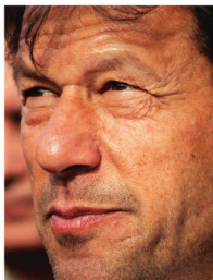
Pakistan Tehreek-e-Insaf (PTI) Leader: Imran Khan Cricketer-turned-politician has gathered huge amounts of support for "anti-status quo" stance