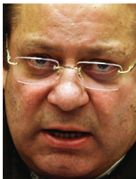
Pakistan Muslim League-Nawaz (PML-N) Leader: Former Prime Minister Nawaz Sharif Pledged to end involvement in U.S.-led war on terror. Powerbase: Punjab