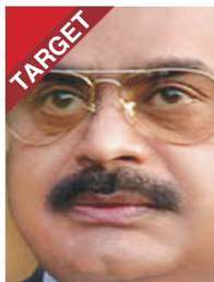
Muttahida Qaumi Movement (MQM) Leader: Altaf Hussain Strongly opposed

to Al Qaeda following 9/11 attacks. Powerbase: Karachi, Hyderabad