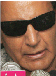
Pakistan Muslim League-Quaid (PML-Q) Leader: Chaudhry Shujaat Hussain Backed General Musharraf's 1999 coup. Powerbase: Punjab, Balochistan