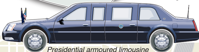
Presidential armoured limousine

Platform built entirely of wood to protect Capitol terrace