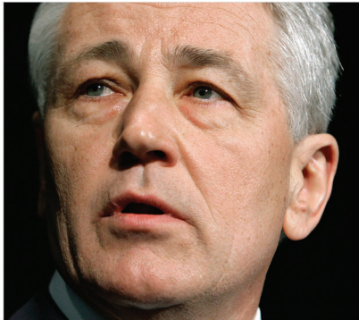
Chuck Hagel, 66. Defence secretary

■ Withdrew from consideration for CIA's top job in 2008 amid questions about his connection to enhanced interrogation techniques used during George W Bush administration