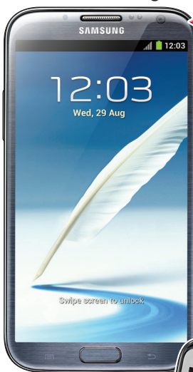
Samsung Galaxy Note II