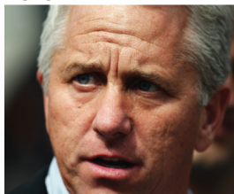
Greg LeMond Standing in 2013