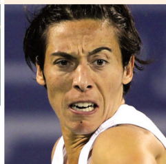
Francesca Schiavone (ITA) Rank: 14

Defending champion, became first Asian to win a Slam. Strong start to 2012 with two finals and four QFs