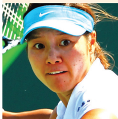
Li Na (CHN) Rank: 7

Won sole Roland Garros crown 10 years ago in 2002 – chasing 14th Grand Slam title after wins on clay at Madrid and Charleston