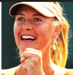
Maria Sharapova (RUS) Rank: 2

Secured No.1 ranking after beating Sharapova in Australian Open – her first Grand Slam final – followed up with wins in Doha and Indian Wells