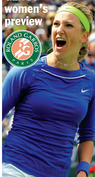
Victoria Azarenka (BLR) WTA Rank: 1

Secured No.1 ranking after beating Sharapova in Australian Open – her first Grand Slam final – followed up with wins in Doha and Indian Wells