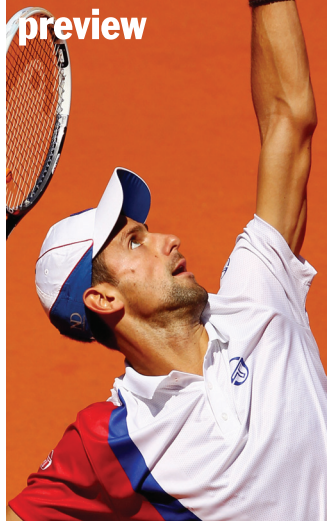
Novak Djokovic (SRB) ATP Rank: 1

World No.1 looking to win fourth successive Grand Slam title – yet to make final at Roland Garros, defeated by Federer in semi-finals last year