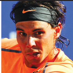
Rafael Nadal (ESP) Rank: 2

World No.1 looking to win fourth successive Grand Slam title – yet to make final at Roland Garros, defeated by Federer in semi-finals last year