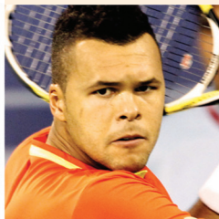
Jo-Wilfried Tsonga (FRA) Rank: 5

Wins at Madrid, Indian Wells, Rotterdam and Dubai this year – runner-up at Roland Garros in 2011, losing in four sets to Nadal