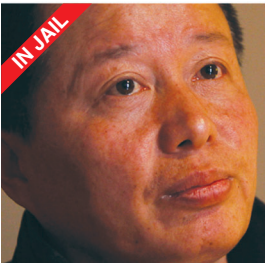
Gao Zhisheng, 46

Combative rights advocate convicted of subversion in 2006, says he was tortured during period of detention