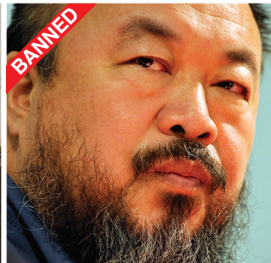
Ai Weiwei, 55

Fled to U.S. in 2009 after fearing arrest