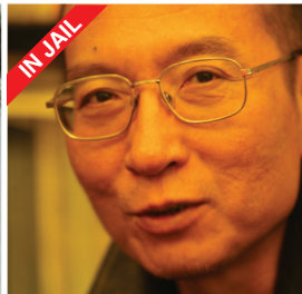
Liu Xiaobo, 56

Leaves U.S. embassy on May 2, a week after escaping house arrest