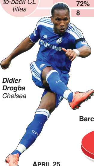
Didier Drogba Chelsea