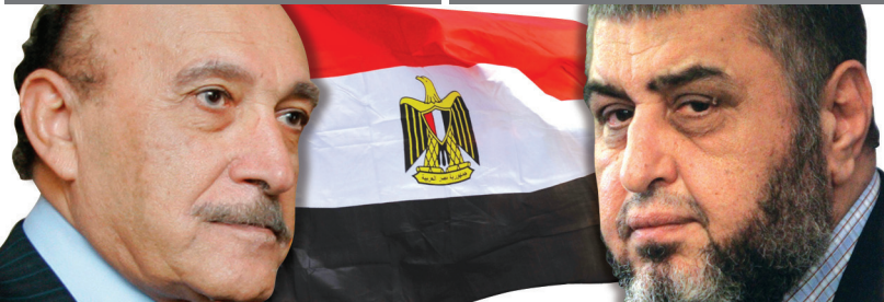
Omar Suleiman, 75

Intelligence chief under Mubarak, entrusted with domestic security and relations with U.S., Israel and Palestinians. Aims to re-establish security and rebuild economy