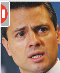
Josefina Vázquez Mota

Former governor of Mexico State hopes to return power to centrist PRI, which ruled Mexico for 71 years until losing to PAN in 2000. Aims to transform Mexico by creating jobs and improving public security