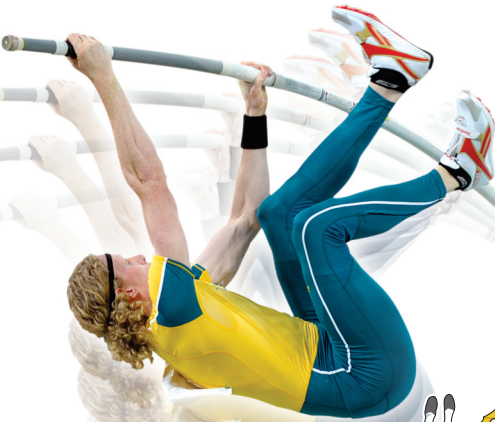
Beijing Olympic Champion Steve Hooker (AUS)