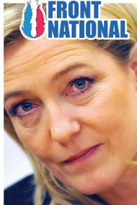
Marine Le Pen

Age 43. National Front leader wants France to quit eurozone, legally separate investment and commercial banks, deport illegal immigrants