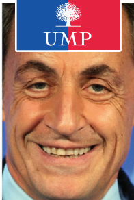
President Nicolas Sarkozy

Age 56. Pledges reforms to boost flagging industrial competitiveness, cut payroll costs, and introduce tax on financial transactions