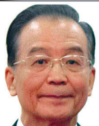
Premier Wen Jiabao