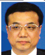
Vice-Premier Li Keqiang