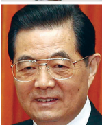
President Hu Jintao