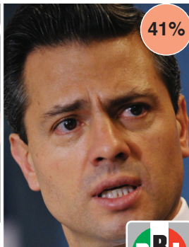
Enrique Pena Nieto

Leftist former mayor of Mexico City is making his second run after razor-thin loss in 2006 to President Felipe Calderon . Has pledged to tackle corruption and work with Mexico's business community