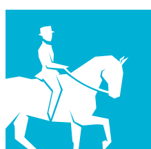
Equestrian – Dressage