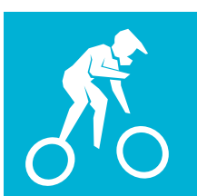
Cycling – BMX