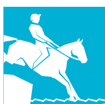
Equestrian – Eventing