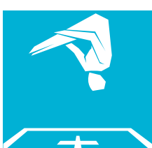
Gymnastics – Trampoline