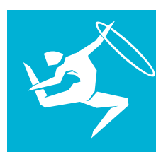
Gymnastics – Rhythmic