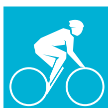
Cycling – Road