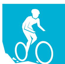
Cycling – Mountain Bike