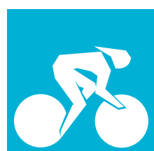
Cycling – Track