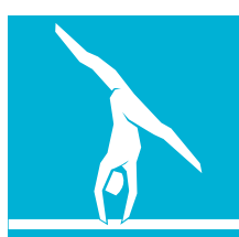
Gymnastics – Artistic