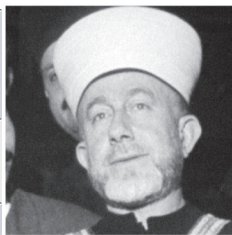
Haj Amin al-Husseini Mufti of Jerusalem, religious and political leader

■ 1919: Palestinian National Congress calls for independence