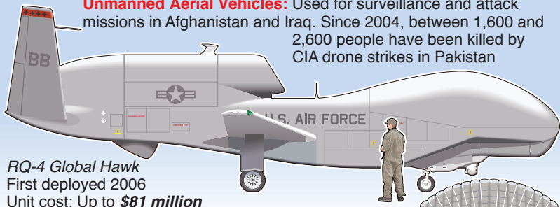
RQ-4 Global Hawk First deployed 2006 Unit cost: Up to $81 million

Unmanned Aerial Vehicles: Used for surveillance and attack missions in Afghanistan and Iraq. Since 2004, between 1,600 and 2,600 people have been killed by CIA drone strikes in Pakistan