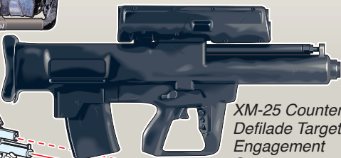
XM-25 Counter Defilade Target Engagement System

XM-25: Rifle uses laser guidance system and microchip-ammunition which can be programmed to detonate over target. First deployed in Afghanistan, 2010. Cost per rifle: $25,000 . Ammunition: $24 per round