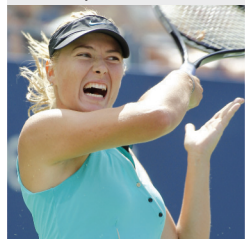
Maria Sharapova (RUS) Rank: 4

2011 has been best year of her career so far, winning Roland Garros and finishing as runner-up at Australian Open