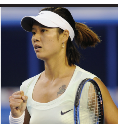
Li Na (CHN) Rank: 7

Ended 2010 season as top-ranked player. Came closest to breaking her Grand Slam duck at 2009 U.S. Open final