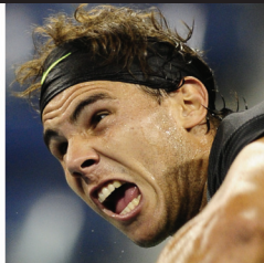
Rafael Nadal (ESP) Rank: 2

Injured shoulder in Cincinnati Masters final, but otherwise has been almost unstoppable this year, winning Australian Open and Wimbledon