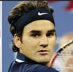
Roger Federer (SUI) Rank: 3

Defending champion will be looking to grab further Grand Slam success, having won his 10th this year at Roland Garros