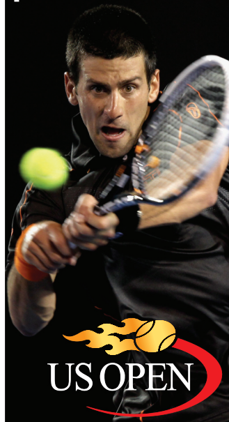
Novak Djokovic (SRB) Rank: 1

Injured shoulder in Cincinnati Masters final, but otherwise has been almost unstoppable this year, winning Australian Open and Wimbledon