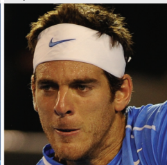
Juan Martin del Potro (ARG) Rank: 18

Still seeking first major. Made final in Melbourne again this year, and semis at Paris and Wimbledon