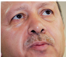
Prime Minister Recep Tayyip Erdogan

Prime Minister Tayyip Erdogan's ruling AK Party won a decisive victory in Sunday's parliamentary election, earning a third successive term of single-party rule