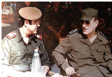
■ 1980: Massacre in Jisr al-Shughour proved precursor to suppression of 1982 armed uprising in Hama against late President Hafez al-Assad (right). Rebellion crushed by Special Forces of Hafez's brother Rifaat (left) – at least 10,000 were killed