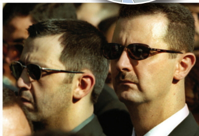
■ 2011: Army's elite Fourth Division, led by Maher al-Assad (left) – brother of President Bashar al-Assad (right) – believed to be heading to Jisr al-Shughour "to restore order" after 120 members of security forces were killed on Monday