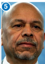
5. Ali Suleiman Aujali: Former ambassador to U.S. defected Feb 22