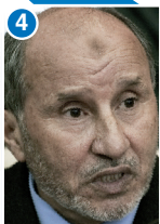
4. Mustafa Abdul Jalil: Former justice minister defected Feb 21