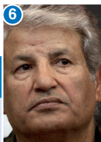
6. Major Gen. Abdul-Fattah Yunis: Former interior minister and special forces chief defected to rebels Feb 22