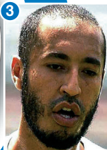
3. Saadi Gaddafi: Rumours that former soccer player wants to negotiate with West