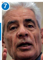
7. Moussa Koussa: Foreign minister – who persuaded Gaddafi to abandon weapons of mass destruction in 2003 – defected to Britain Mar 31