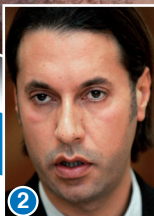
2. Mutassim Gaddafi: National Security Adviser believed to support Ismail's visit to London