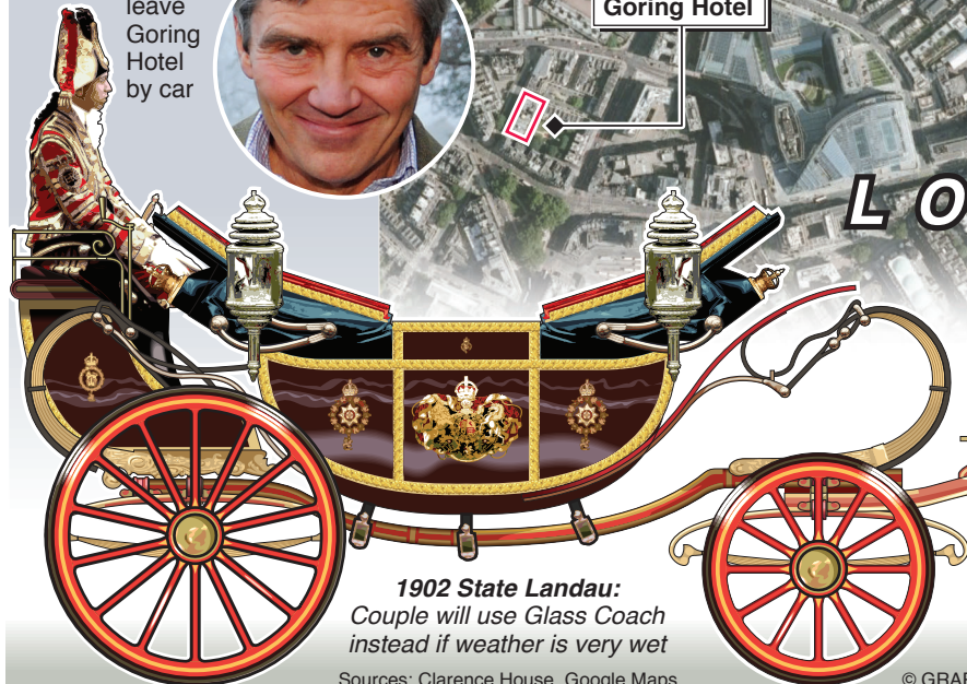
1902 State Landau: Couple will use Glass Coach instead if weather is very wet