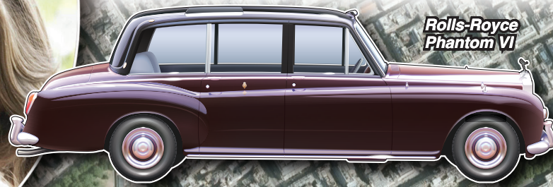
Rolls-Royce Phantom VI