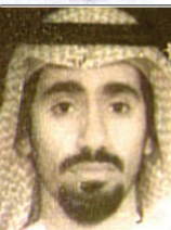
Abdul Rahim al-Nashiri

Believed to be chief intermediary between 9/11 hijackers and Al Qaeda leaders. Slated to be "20th hijacker" but failed to obtain U.S. visa