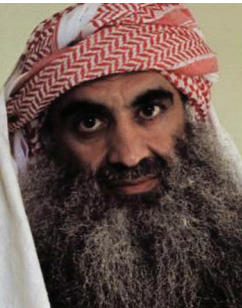
Khalid Sheikh Mohammed

Alleged mastermind of 9/11 attacks. Captured in 2003, held at Guantanamo since 2006. Plans to try him in civil court derailed by political and public opposition. Case against him remains unclear