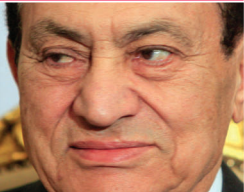
President Hosni Mubarak (1981-2011)

Population 84.5m Median age 24.0 GDP per capita $1,991 Jobless rate 9.4% Oil production 678,000