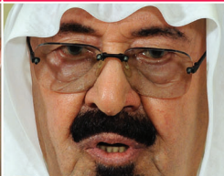
King Abdullah (2005)

Population 25.7m Median age 24.9 GDP per capita $24,200 Jobless rate 10.5% Oil production 9.8m