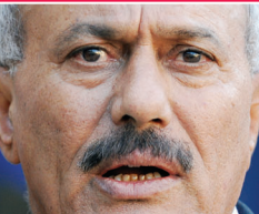
President Ali Abdullah Saleh (1978)

Population 24.3m Median age 17.9 GDP per capita $1,060 Jobless rate 35% Oil production 287,000