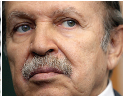
President Abdelaziz Bouteflika (1999)

Population 35.4m Median age 27.1 GDP per capita $4,845 Jobless rate 10.0% Oil production 2.1m