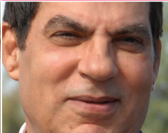
Pres. Zine al-Abidine Ben Ali (1987-2011)

Population 10.4m Median age 29.7 GDP per capita $3,903 Jobless rate 13.3% Oil production 91,000