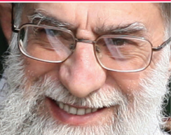
Ayatollah Ali Khamenei (1989)

Population 75.1m Median age 26.3 GDP per capita $10,900 Jobless rate 14.6% Oil production 4.2m