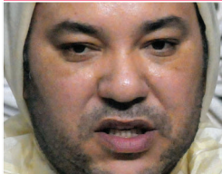
King Mohammed VI (In power since 1999)

Population 32.3m Median age 26.5 GDP per capita $2,769 Jobless rate 10.0% Oil production Barrels per day 3,938