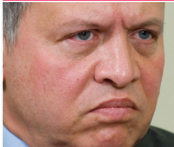
King Abdullah II (1999)

Population 5.7m Median age 21.8 GDP per capita $5,100 Jobless rate 11.9% Oil production Zero