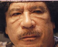
Colonel Muammar Gaddafi (1969)

Population 6.5m Median age 24.2 GDP per capita $14,802 Jobless rate 13.0% Oil production 1.8m