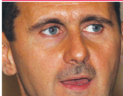
President Bashar al-Assad (2000)

Population 22.2m Median age 21.5 GDP per capita $4,800 Jobless rate 8.3% Oil production 400,000