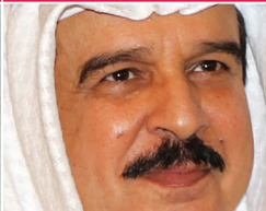
Sheikh Hamad bin Isa al-Khalifa (1999)

Population 807,000 Median age 30.4 GDP per capita $40,400 Jobless rate 15% Oil production 48,000