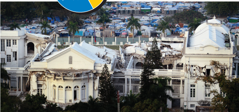
Presidential Palace still in ruins, surrounded by tents for displaced