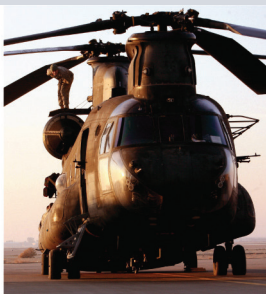
Aircraft: 19 CH-47D Chinook transport helicopters, six E-2C Hawkeye early warning