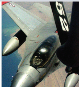
F-16s: 240 already supplied, 20 advanced F-16C/D on order, plus Patriot missile systems