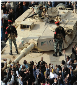
M1A1 Abrams Main Battle Tank: Cairo has bought 973 U.S. tanks, 225 more on order