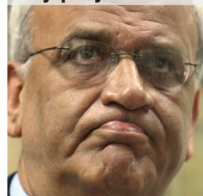
Saeb Erekat Chief Palestinian negotiator