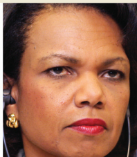
Condoleezza Rice : U.S. Secretary of State