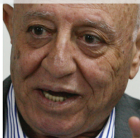
Ahmed Qurei Negotiator, also known as Abu Ala