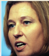
Tzipi Livni : Lead Israeli negotiator, foreign minister