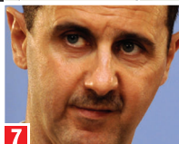
President Bashar al-Assad ( 2000 ).

Blueprint for long-term political, economic and social change has yet to be implemented