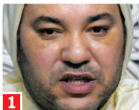
King Mohammed VI ( In power since 1999 ).

Arab leaders are expected to implement a proposed $2 billion programme to revamp their faltering economies as fears of protests like those in Tunisia add urgency to the need to alleviate poverty across the region