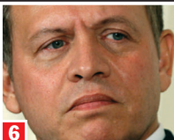
King Abdullah II ( 1999 ).

Seized power in military coup, rules with iron fist. Wanted on charges of war crimes in Darfur