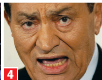
President Hosni Mubarak ( 1981 ).

Presides over system of "people's congresses" but in practice he rules unopposed