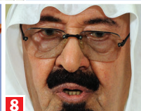
King Abdullah ( 2005 ).

Granting of real political freedoms and shake-up of state-dominated economy have not yet materialised