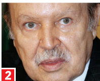
Pres. Abdelaziz Bouteflika ( 1999 ).

Has overseen some economic and social liberalisation, but still retains sweeping powers