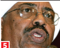
President Omar al-Bashir ( 1989 ).

TUNISIA: President Zine al-Abidine Ben Ali, in power since 1987, flees into exile after weeks of protests