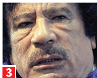
Colonel Muammar Gaddafi ( 1969 ).

Parliament seen as rubber-stamp body, with power concentrated in presidency. State of emergency in place since 1992