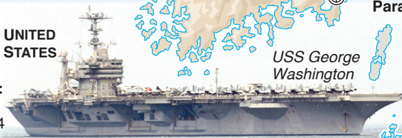
USS George Washington