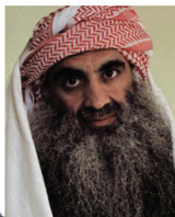
Khalid Sheikh Mohammed

Charged with selecting and training some of hijackers