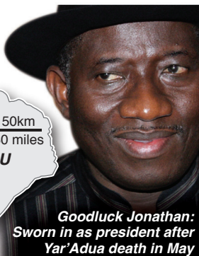
Goodluck Jonathan: Sworn in as president after Yar'Adua death in May