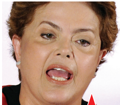
Dilma Rousseff, 62, Workers' Party. Former chief of staff to outgoing president Luiz Inacio Lula da Silva

Support for Brazil's ruling party presidential candidate Dilma Rousseff is holding, according to the latest election poll, putting her on course for a first round victory over opposition hopeful Jose Serra