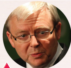
Kevin Rudd Tony Abbott