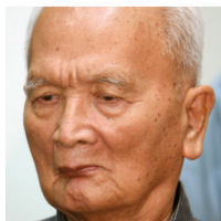
Nuon Chea , 84

OTHER FORMER REGIME LEADERS – trials due to start in 2010