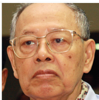
Ieng Sary , 85

Also known as “Brother Number Two”, was deputy to Khmer Rouge founder Pol Pot