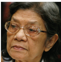
Ieng Thirith , 78

“Brother Number Three” – Khmer Rouge’s foreign minister, arrested in 2007