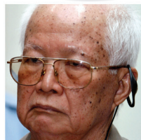
Khieu Samphan , 79

Ieng Sary’s wife was most senior woman in regime as Minister of Social Affairs