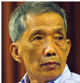
Kaing Guek Eav , known as Duch , 67

A UN-backed war crimes tribunal has convicted and sentenced former Khmer Rouge prison chief Duch for crimes against humanity, in the first verdict involving a senior member of the “killing fields” regime blamed for the deaths of 1.7 million Cambodians