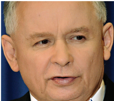
Jaroslaw Kaczynski, 61 Law and Justice Former prime minister and identical twin brother of late president

Has pledged to end conflict between presidential palace and prime minister's chancellery that has marked past three years