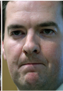
Left to right: David Cameron (leader), William Hague (foreign affairs), Baroness Sayeeda Warsi (community), George Osborne (finance)

■ Economy: Will hold emergency budget within weeks of taking office. Harsh spending cuts in first year to reduce forecast £167 billion borrowing, without endangering economic recovery. Create guarantee scheme to underwrite lending from banks to businesses. Protect health spending