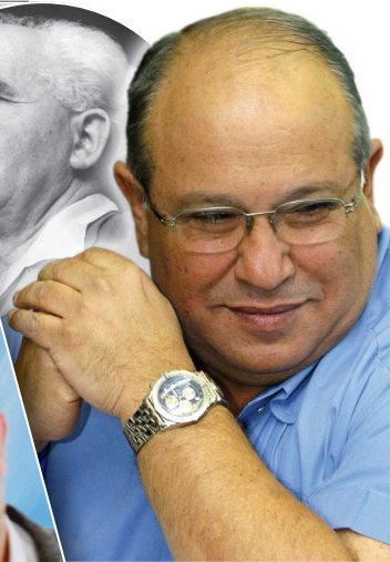
Al-Mabhouh: Killed Jan 20

■ 1990: Canadian ballistics expert Gerald Bull assassinated in Brussels, Belgium, for his involvement in Supergun project of Iraq's Saddam Hussein