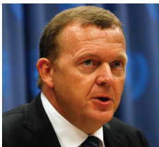
Prime Minister Lars Lokke Rasmussen

While others have played down hopes for the Copenhagen summit, Danes insist a successor to the Kyoto Protocol can be achieved, and have set an enviable example by expanding the economy without increasing emissions