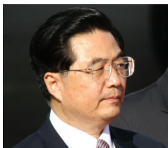
President Hu Jintao

The world's biggest producer of greenhouse gases is especially vulnerable to the effects of climate change, and China brings to the Copenhagen table a plan to reduce GHG intensity by 40% – but emissions could still rise